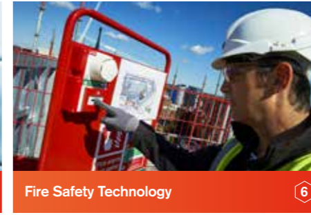
Fire Safety Technology